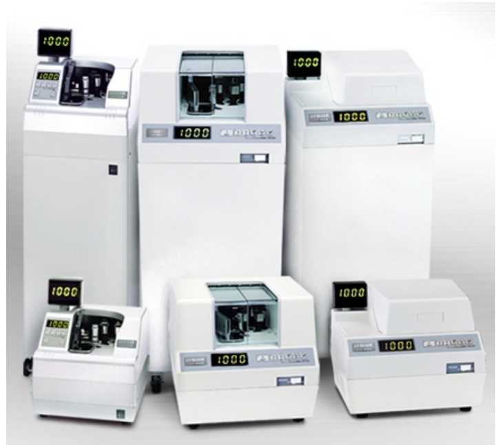
VCM-525 MINI CONSOLE VCM-525 MINIDESKTOP